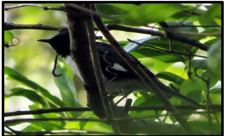
Black-throated Blue Warbler