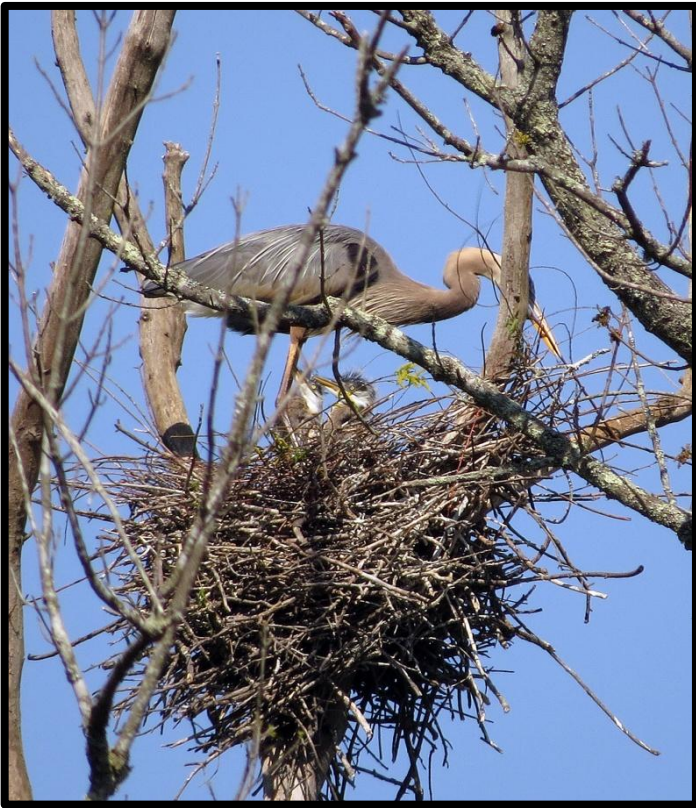
Great-blue Heron and Chicks