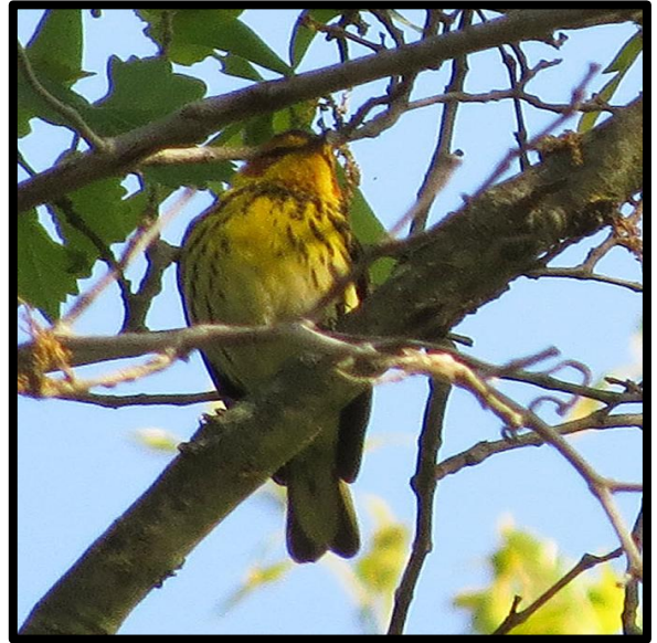
Cape May Warbler